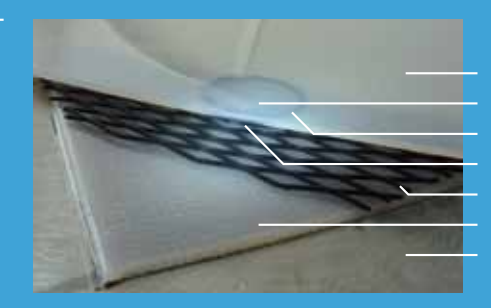
Inner PFA Liner Plastlite Fixpoint Plastlite Weld Hot gas weld Spacer net Glued PFA Liner Carbon Steel

Principle of double wall fix point lining with a constant monitoring system for maximum safety