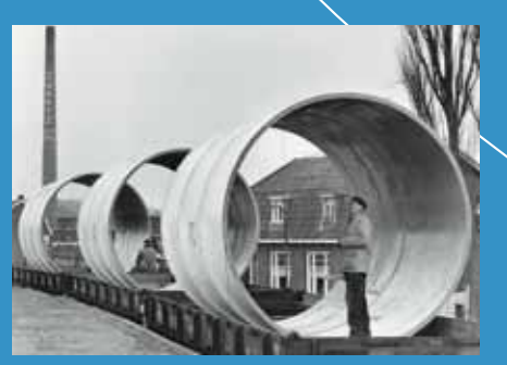
Transport of big diameter GRP cylinders to Germany in 1963

Plasticon Composites is an international installation and service solutions for the processing, storage and transport of highly critical corrosive fluids and gasses. The products are constructed from high quality has a consolidated geographical presence, with a multi-lingual staff and an active research and development programme. Our technical support team of specialists assists customers in the early planning and design stages of projects. Plasticon Composites aims to reach an optimum end-result with solutions that reduce operational costs for its customers. Composite structures by Plasticon Composites come in a wide forms, depending on process specifications. The versatility of working with today's composites, combined with the Plasticon extensive range of integrated solutions.