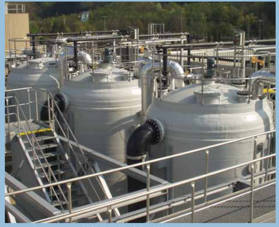
Storage of waste water at 90 °C (3 x 120 m<sup>3</sup>, D = 3500 mm)