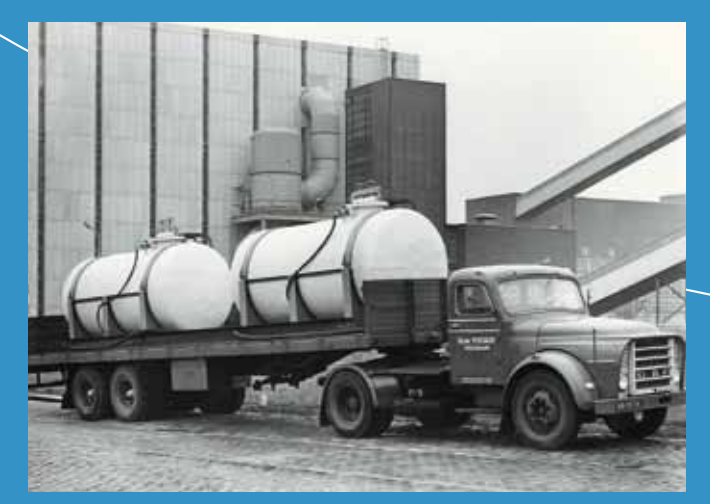
Transport of horizontal PVC/GRP tanks for a chemical plant in the Netherlands in 1959