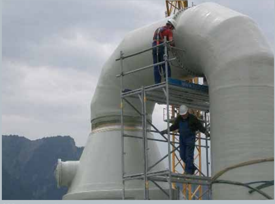
GRP piping, installed by our installation people

In addition, Plasticon Composites manufactures and installs PVC lined GRP pipes for aggressive products such as chlorine gas, hydrochloric acid, sodium hypochlorite and caustic soda. Various thermoplastic and fluoropolymer liners were combined by Plasticon Composites (PVC, C-PVC, PP, PE, PVDF, E-CTFE, FEP, PFA, MFA) with glassfibre reinforced polyester resins to provide customers with dual laminate piping systems for extremely hot and corrosive environments.