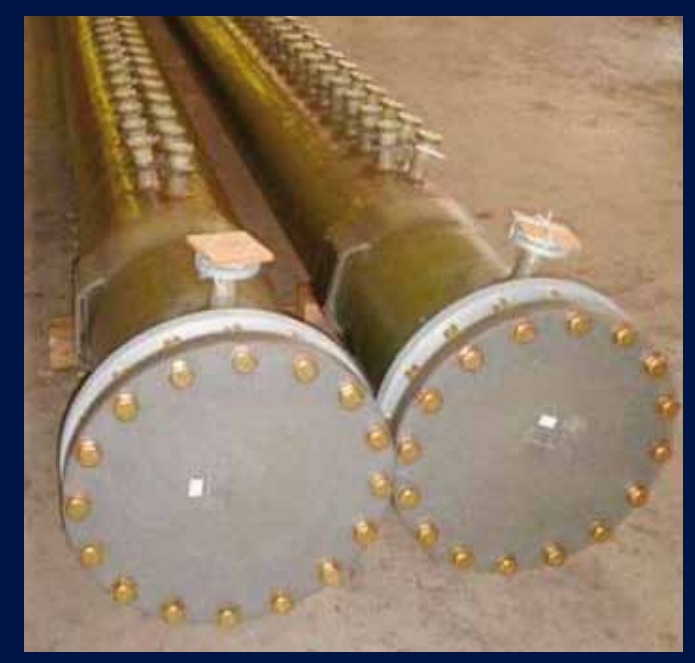
Two catholyte PP, GRP headers for the chlorine industry